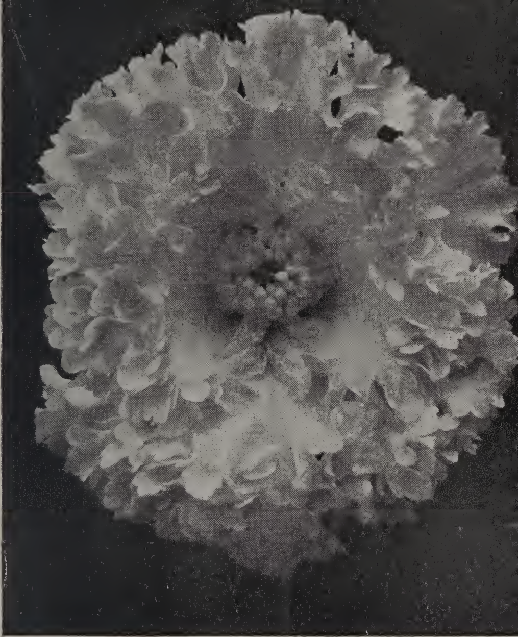
CRIPSA Single Frilled